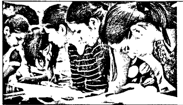
NO RUNNING AROUND: This admission season, students will not have to go through the rigmarole of filling forms for applying to colleges

However, those willing to know more about the courses and colleges should wait for the university to upload its information bulletin on the DU website. Individual colleges will also release their prospectus prior to the release of cutoffs. "Since there will be no running around like previous years, students must visit the websites of different colleges to know more about the courses and facilities they offer and also about their faculty. How-